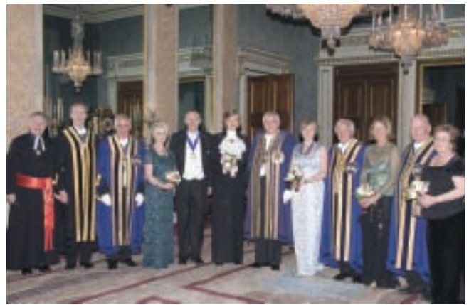
The Court and top table guests at the Banquet.