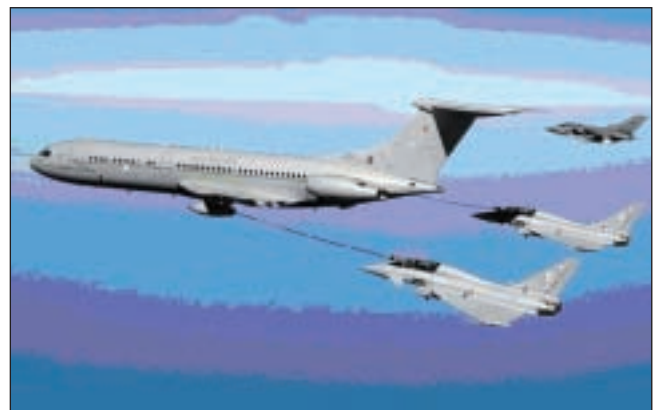
A VC10 aircraft refuelling two fast jet aircraft, with another waiting for a 'top up'.