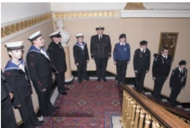
Members of the Sea Cadet Corps and St John Ambulance Cadets line the stairs of the Fishmongers' Hall