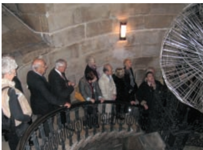
The party admire Flare II by Antony Gormley which hangs over the Cathedral's Geometric Staircase.

A group of 50 Liverymen, their wives and guests joined the Master and his lady for a privileged tour of the upper Triforium Galleries at St Paul's Cathedral in early November. These Galleries, which are not normally open to the public, comprise the Model Room with the huge original architect's model of St Paul's, the Library with its vast collection of delicate and historic books, and the space known as 'the BBC view' where cameras are located on key occasions to provide the most splendid panorama of the nave through to the choir stalls and high altar. The tour ended with the party descending the magnificent Geometric staircase and admiring Antony Gormley's installation, Flare II . With two guides and the Cathedral's librarian to host us, the visit was both educational and enjoyable.