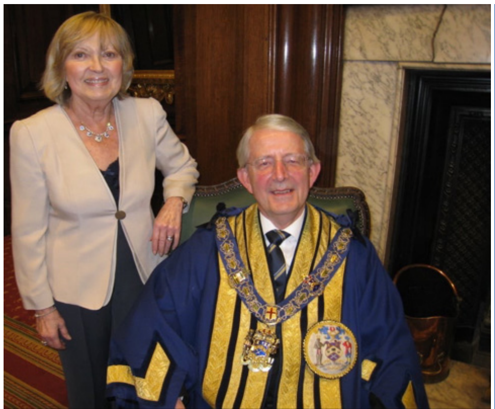
The Master and his Lady