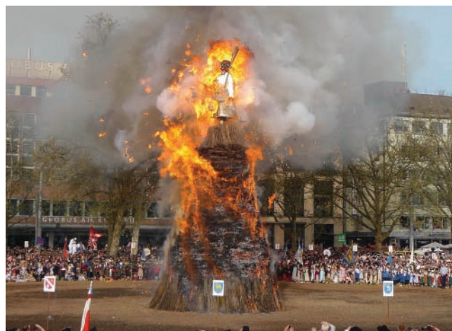
Burning the Böögg giant snowman to herald the start of spring.