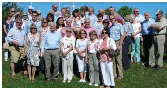
The party on the Stockholm visit

This year's Fellowship Weekend took place in sun-soaked Stockholm at the beginning of June, where the Master and his lady organised a full and varied programme of events for over 40 Liverymen and their partners.