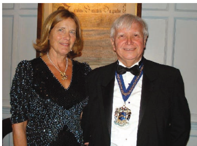
The Master and his lady at the Ladies' Dinner