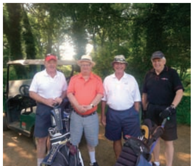
Ray Jeffs Cup Team.

The AGM is once again being held at Jamies Wine Bar in Ludgate Hill at lunchtime on Friday 7 December. Do join us.