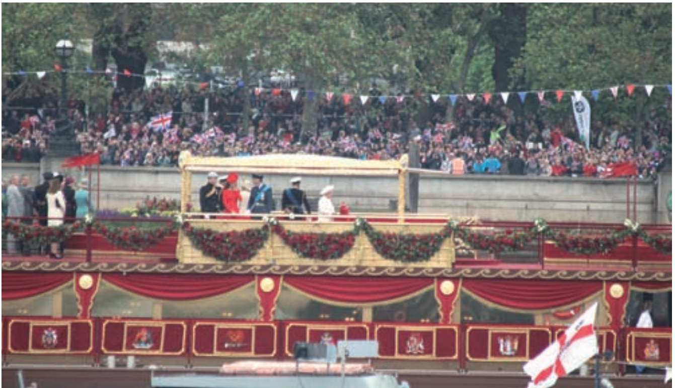
The Queen's Barge sails down the Thames.