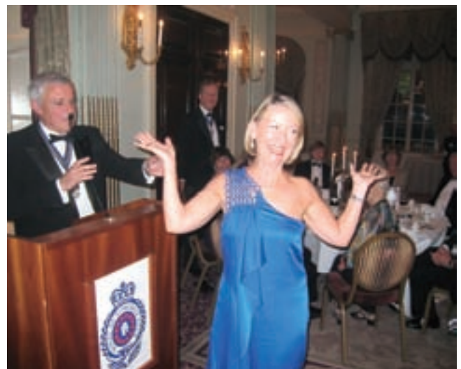
A happy Auction winner.

The evening began with a champagne reception in the Committee Room, and then everyone was ushered to the skirl of the bagpipes into the Mountbatten Room, where they enjoyed an excellent dinner.