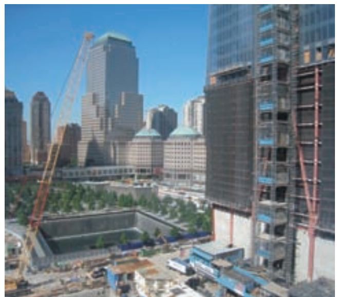
View of the Memorial Gardens and bases of the Twin Towers.

Saturday daytime was free for sightseeing and shopping before we went to a local 'deli' for supper before enjoying the Cirque de Soleil show Zarkana at the world famous Radio City Music Hall. Sunday was free to browse or shop before the whole party joined up one last time to enjoy a dinner cruise around the Statue of Liberty, offering magnificent views of the Manhattan skyline.