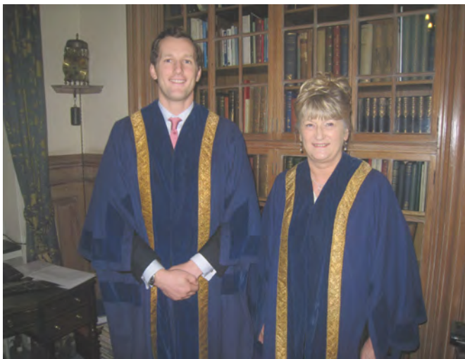
Our two new Liverymen