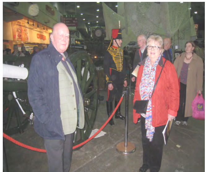
The Master, his Lady and King's Trooper RHA