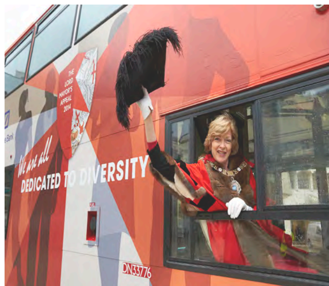
The Lord Mayor at work