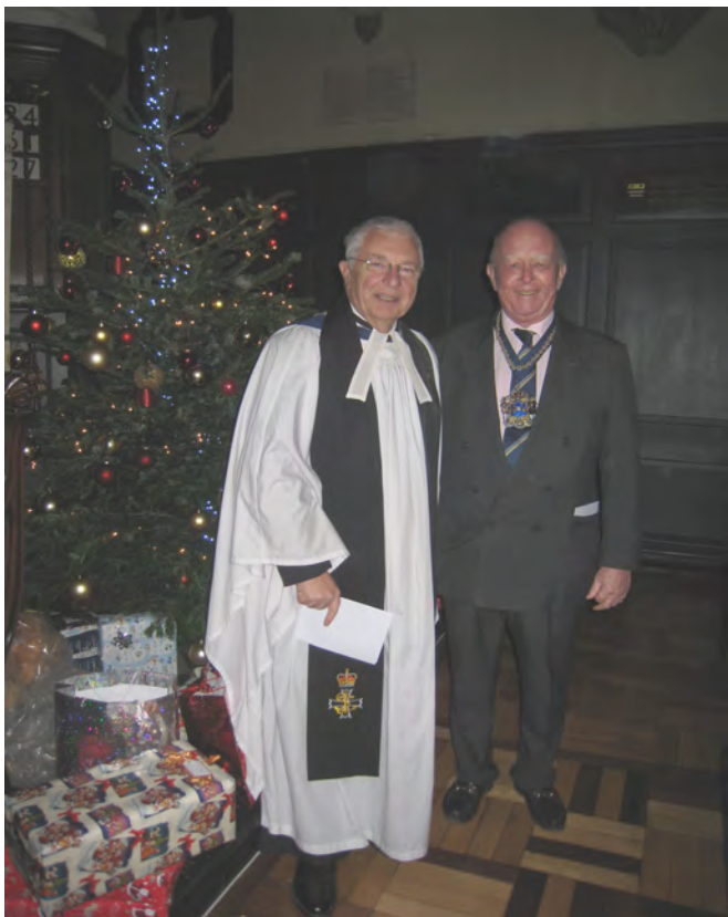
The Master and Chaplain