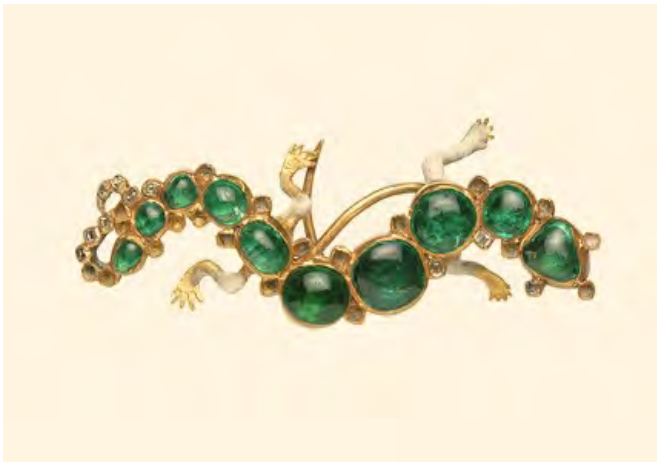
Salamander: gold, emeralds, diamonds