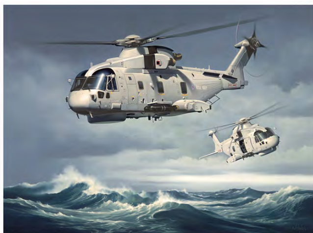
Merlin Mark 2

As your liaison officer I shall pursue this generous invitation so would ask you to keep an eye open for notices from the Clerk.