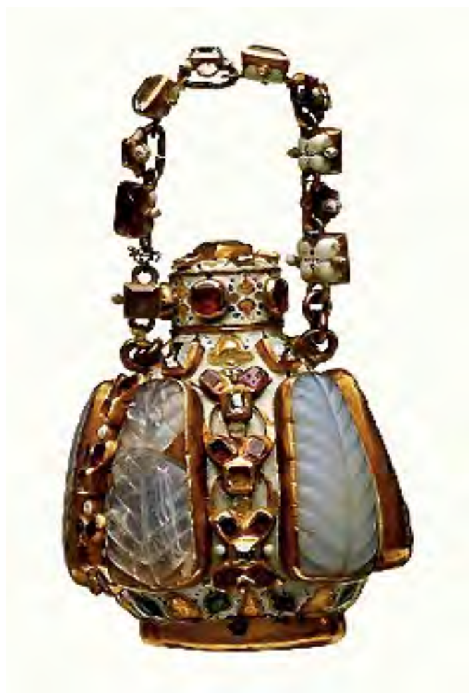
Scent bottle: gold and white enamel

The reconstruction of a jewellery workshop including a gold and silver wyre drawing bench, demonstrated the unique craftsmanship of the period, and the direct link to our own Company. Finally an excellent video, providing one possible answer to the riddle of why the hoard was never claimed, completed an extraordinary experience, rounded off by supper at the Museum Restaurant.