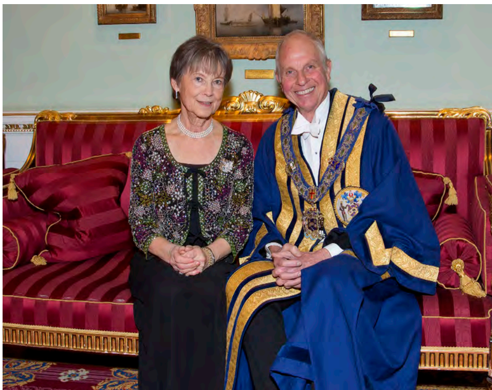
The Master and his Lady