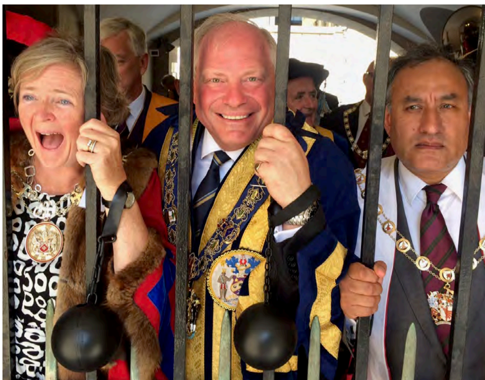
Jailed and Bailed!

June 16th 325th Anniversary dinner London Zoo