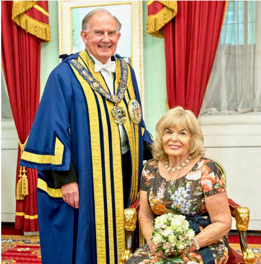
The Master and his Lady