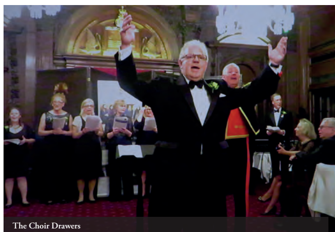
The Choir Drawers