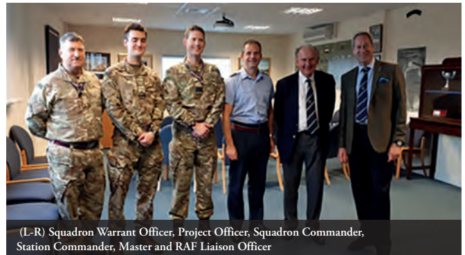
(L-R) Squadron Warrant Officer, Project Officer, Squadron Commander, Station Commander, Master and RAF Liaison Officer

We took lunch in the Warrant Officers and Sergeants' Mess with a number of personnel from both units, which allowed us an opportunity to really get a sense of what life is like in the RAF and those units, and to get a first-class impression of their pride and passion!