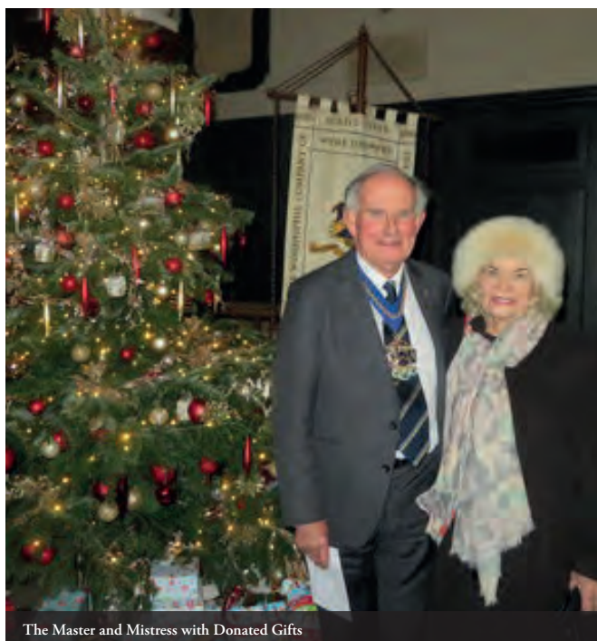
The Master and Mistress with Donated Gifts