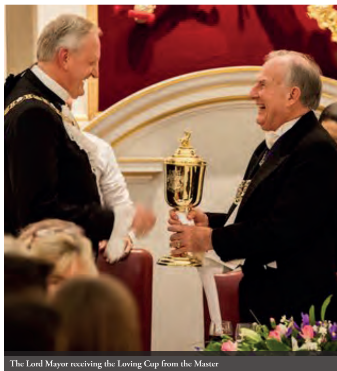
The Lord Mayor receiving the Loving Cup from the Master